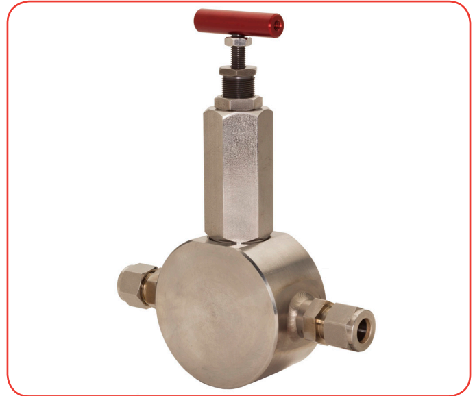
Type SMV Valve